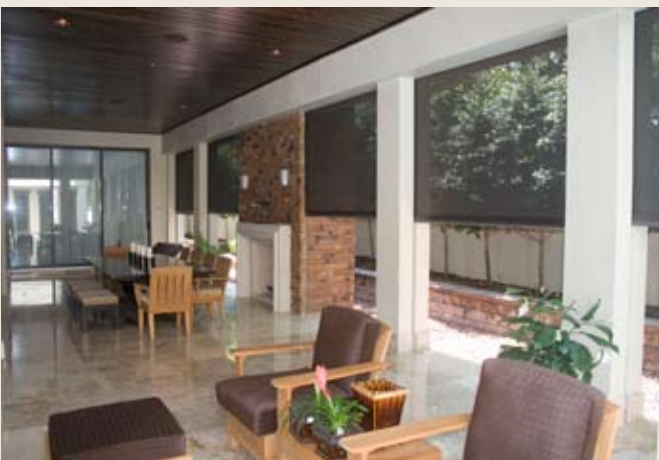
Recessed Executive Screens using 90% sun block material to reduce UV rays and interior heat gain.

The Phantom Screens Architectural and Builder Services program provides building and design professionals with resources on product specifications and the integration of Phantom retractable screen solutions into residential and commercial building projects.