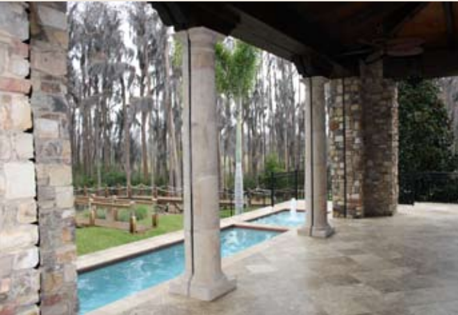
Recessed Executive Screens integrated in pre-cast and stone columns.