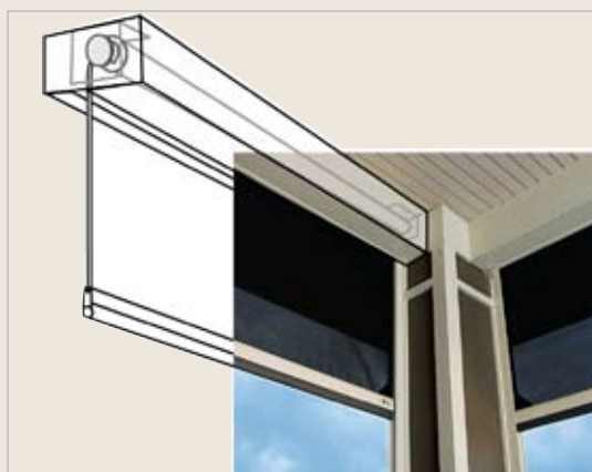
Recessed mount with detail of contents of cavity.