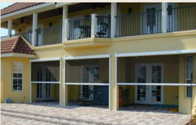
Standard mount Executive Screens with housings and standard tracks. Outside above header mount.

Phantom's Executive Screens can be either surface-mounted (with housing and cover) or recessed into an opening (without housing and cover). Standard units are normally retrofitted onto the existing structure, and the housing unit will therefore be visible. Recessed units are usually installed during the construction process and are placed inside of a cavity that is built by the contractor.