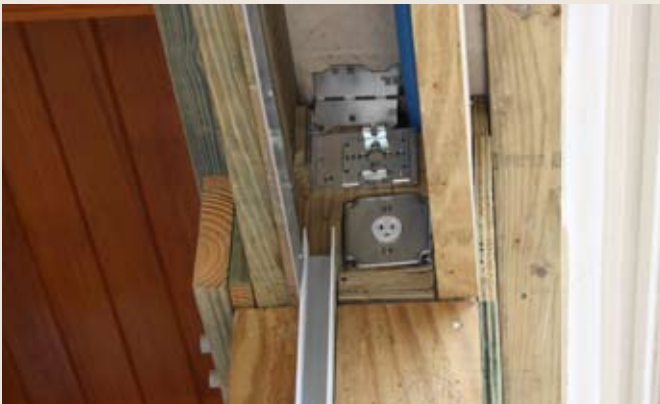
Unfinished cavity and column showing mounting brackets, electrical connections, and u-channel placement.