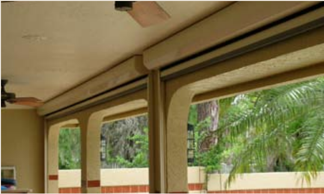
Standard mount Executive Screens with housings and standard tracks. Inside above header mount.