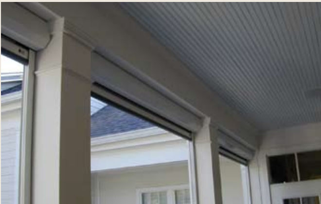
Standard mount Executive Screens with housings and standard tracks. Under header mount.