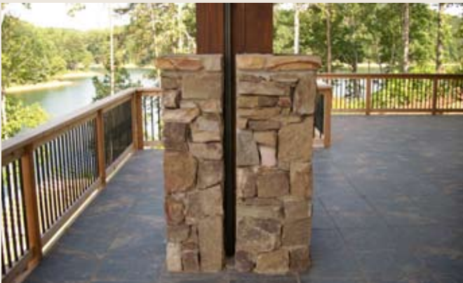
U-channel installed within a mixed column of wood and stone.

Recessed or Standard mount screen installations will incur electrical costs in addition to that of the standard wiring of the structure. The outlets needed for retractable screens have to supply 110v to power the motor, requiring about 1.6 amps per unit. Required power outlets must be installed in or near the roller where the motor is located. A review of the motor control options and home automation interface is also advisable.