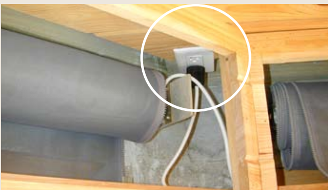
Duplex electrical outlet installed inside the cavity outside the working area of the screens roller, mesh and motor.

As in any typical construction project, the integration of motorized screens involves the builder or the builder's superintendant, Phantom's Authorized Distributor responsible for the territory where the project is to be completed, and subcontractor tradesmen (electricians, framers, and finish carpenters).