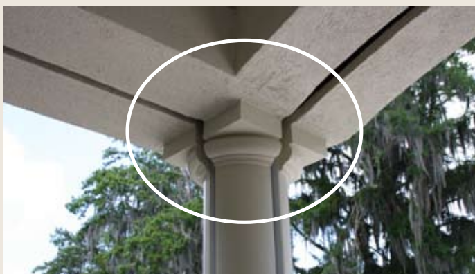
Recessed mount Executive Screens showing screen exit opening and recessed u-channel built into fiberglass Roman columns.