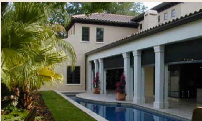
Recessed mount Executive Screens built into cavities with recessed u-channel in decorative columns.