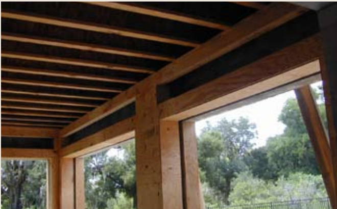
Cavity framed in top of header opening with front access. U-channel mounted in columns surrounded by framing before stucco finish is applied.