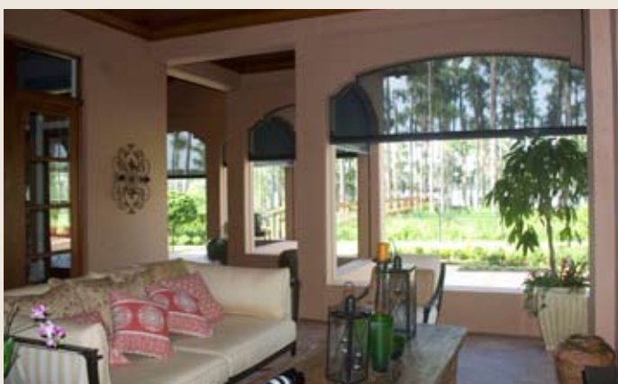
Arched openings with 80% sun block to control UV rays and temperature create a more livable outdoor space.