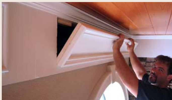
Customized for your home, Phantom's screens are integrated for long term use and easy maintenance.

Recessed units are most commonly installed during a new construction project or a major remodel. The main appeal of recessing motorized screens is to hide the mechanisms and side tracks without affecting the architectural aesthetics of the building. In most custom homes it is the preferred installation choice of both the client and architect.