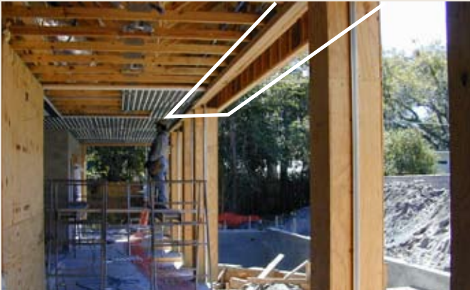
Cavity framed in top of opening with bottom access, u-channel mounted on column before finish is applied.