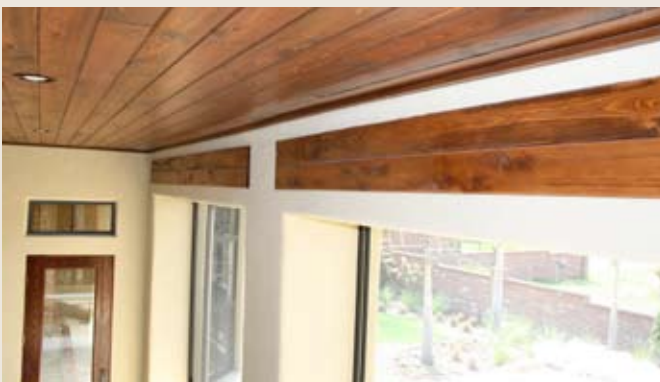
Removable front access panels finished to complement wooden tongue and groove ceiling.

Phantom Screens recommends that professionals review the columns finish details to determine any additional costs that may occur. Additional time may be required for applying the lathing and column prep for the selected finish.