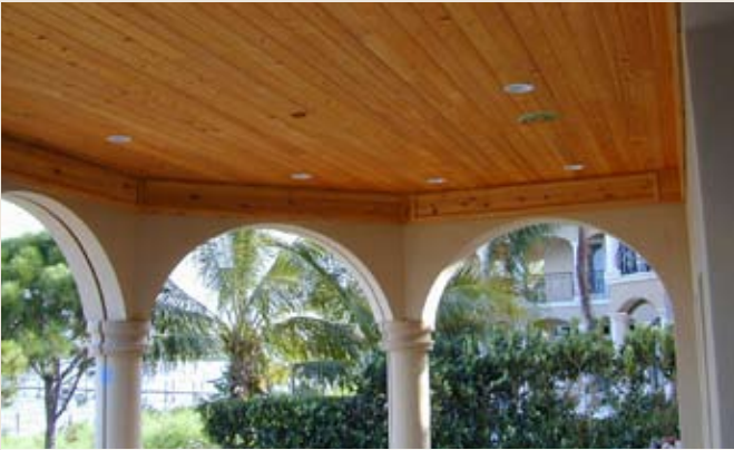
Recessed Executive Screens mounted within multiple arched openings, with removable front access panels.